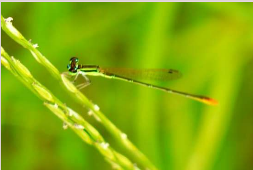
Piyush - Grade 12 (IBDP)