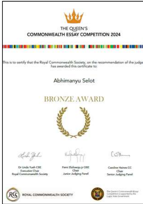
Abhimanya Sehlot - Grade 12 (IBDP)