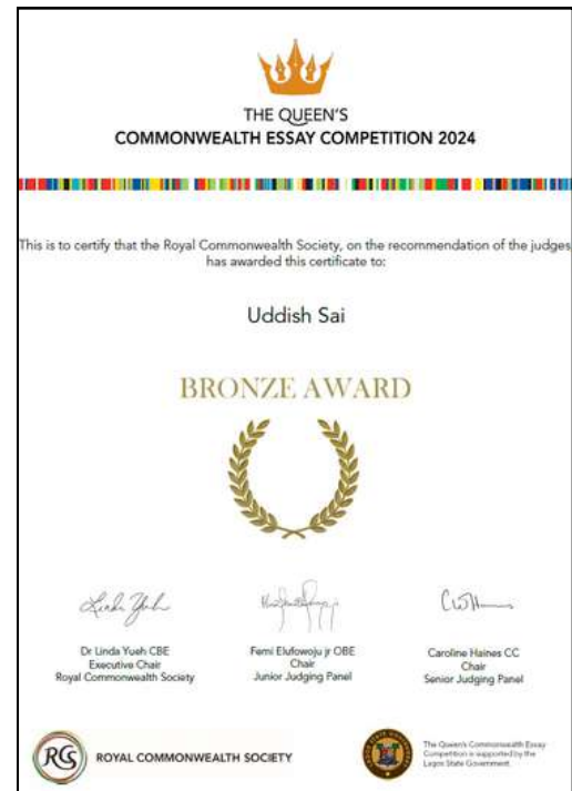
Uddish Sai - Grade 10 (IGCSE)