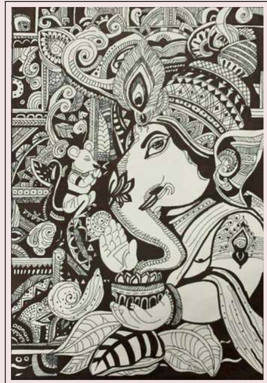
Angel - Grade 8 (CLS)