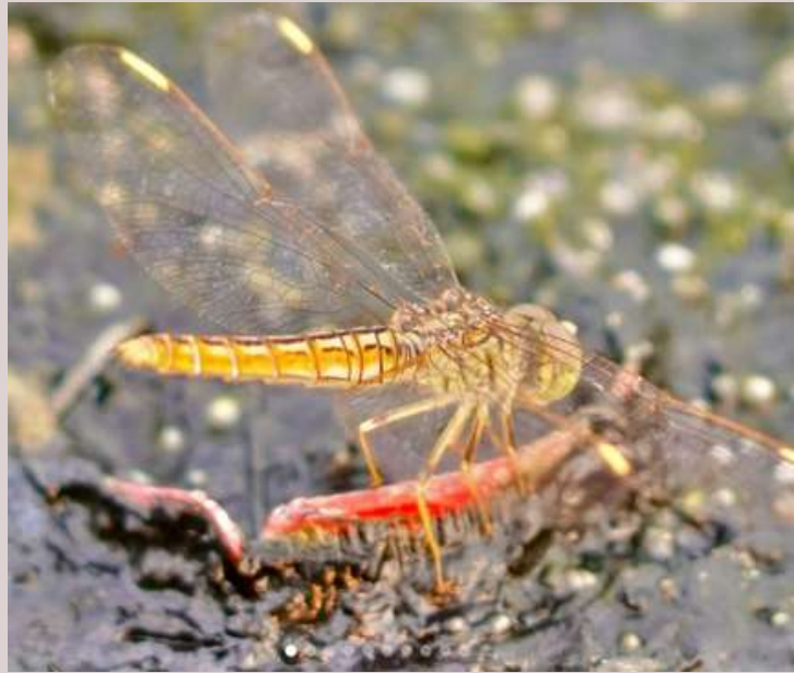
Piyush - Grade 12 (IBDP)