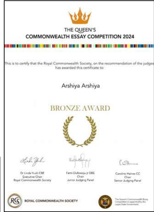
Arshiya - Grade 10 (IGCSE)