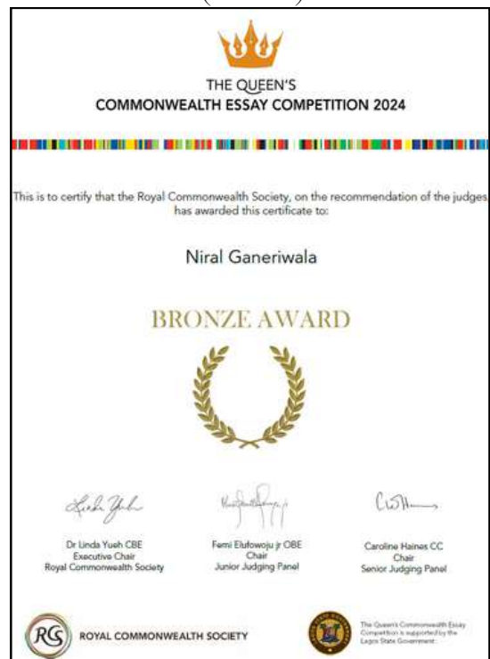
Niral Ganeriwala - Grade 9 (IGCSE)